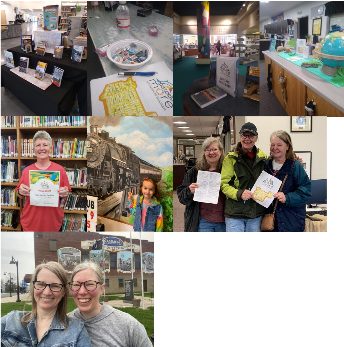
top left to right: Somerset, Ellsworth, River Falls, Durand middle: Luck, Altoona, Plant sale, Durand bottom: Hammond